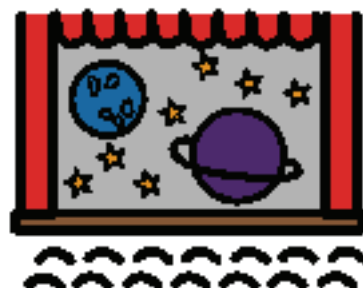
看 ㄎㄢˋ 電 ㄉㄩㄢˋ 影 ㄩㄥˊ