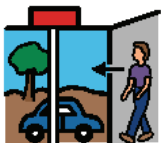
出 ㄔㄨˊ 去 ㄑㄩˋ 玩 ㄨㄢˊ