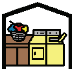
洗 ㄒㄩㄥˋ 衣 ㄩㄠˊ 服 ㄈㄨˊ