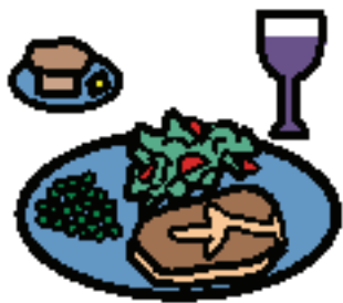
晚 ㄨㄢˇ 餐 ㄘㄨㄢˊ